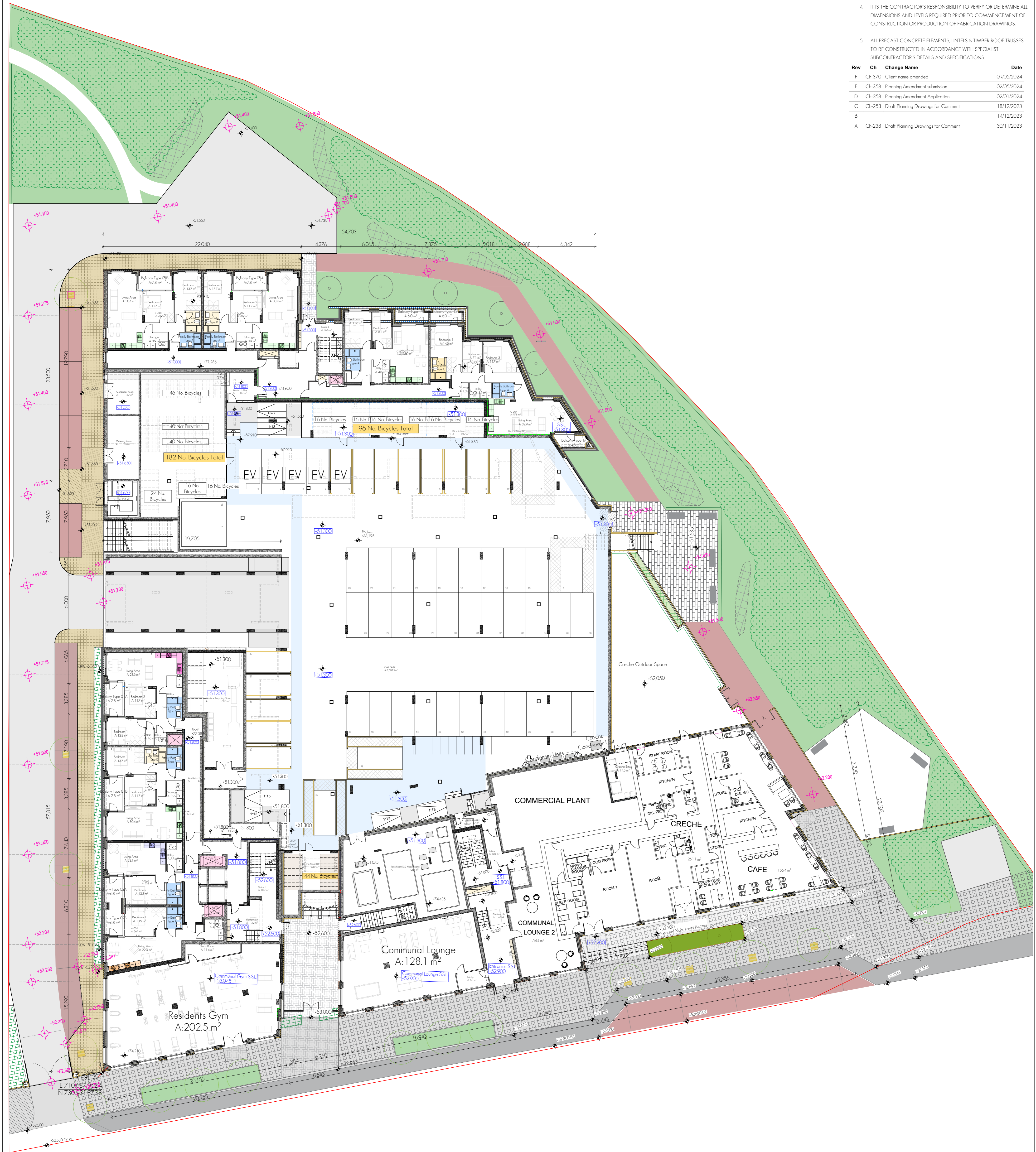
Granted Level 0 - Ground Floor Plan 1:200