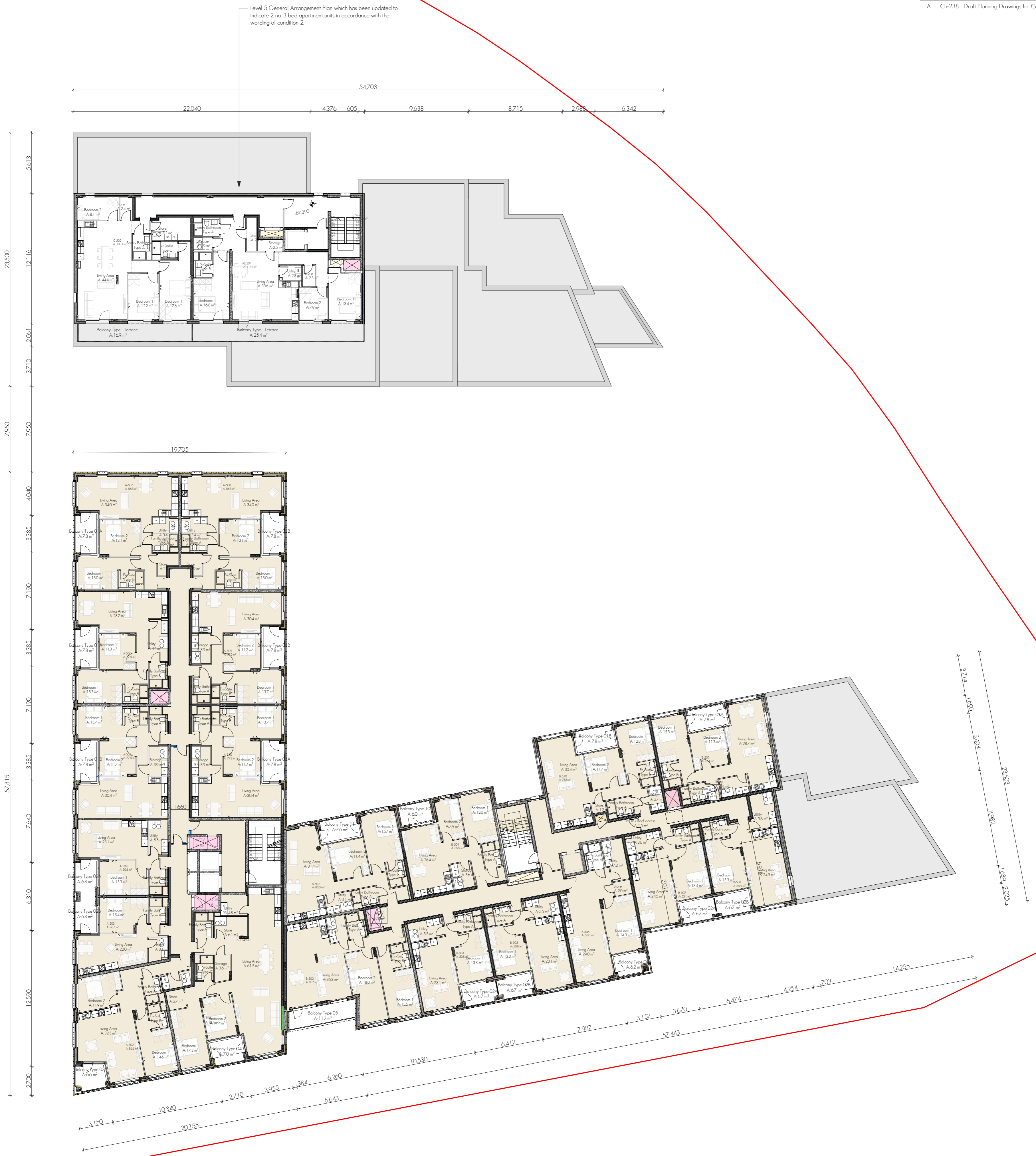
Granted Level 5 - Fifth Floor Plan 1:200

Level 5 General Arrangement Plan which has been updated to indicate 2 no. 3 bed apartment units in accordance with the wording of condition 2.