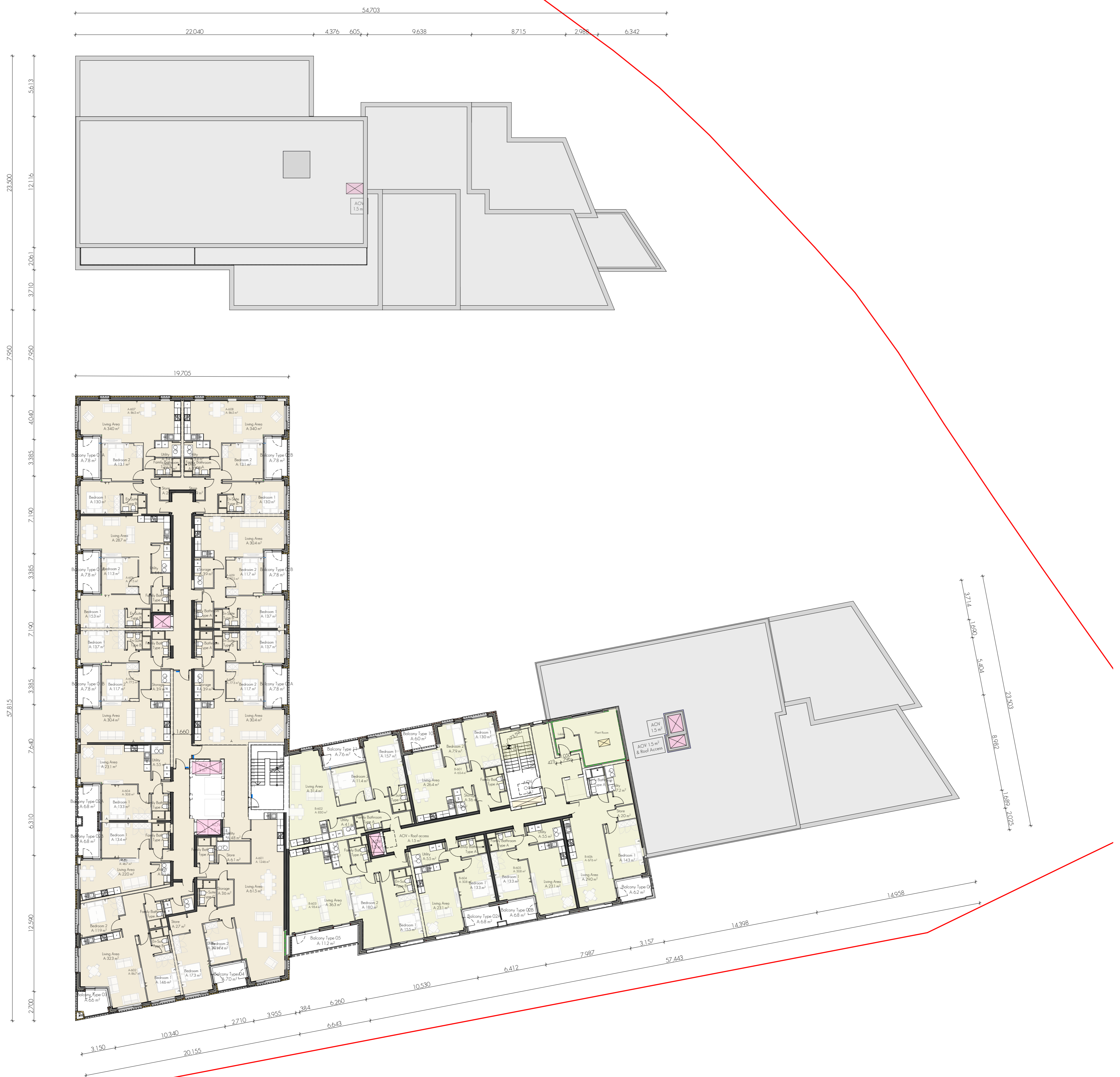
Granted Level 6 - Sixth Floor Plan 1:200