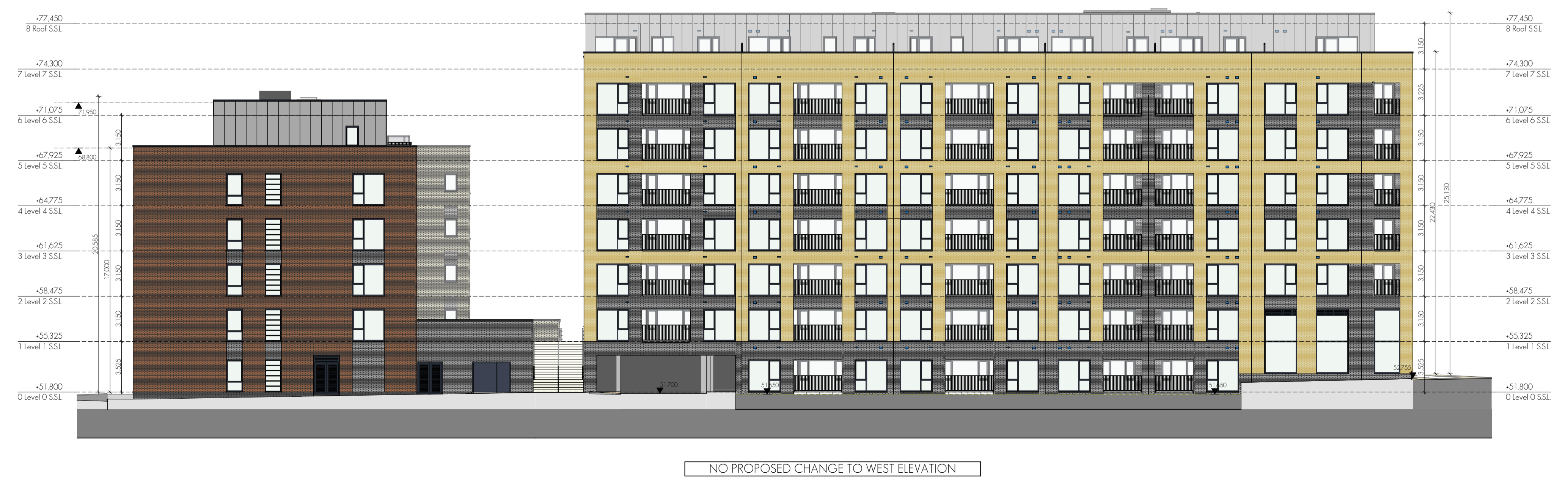
West Elevation 1:200