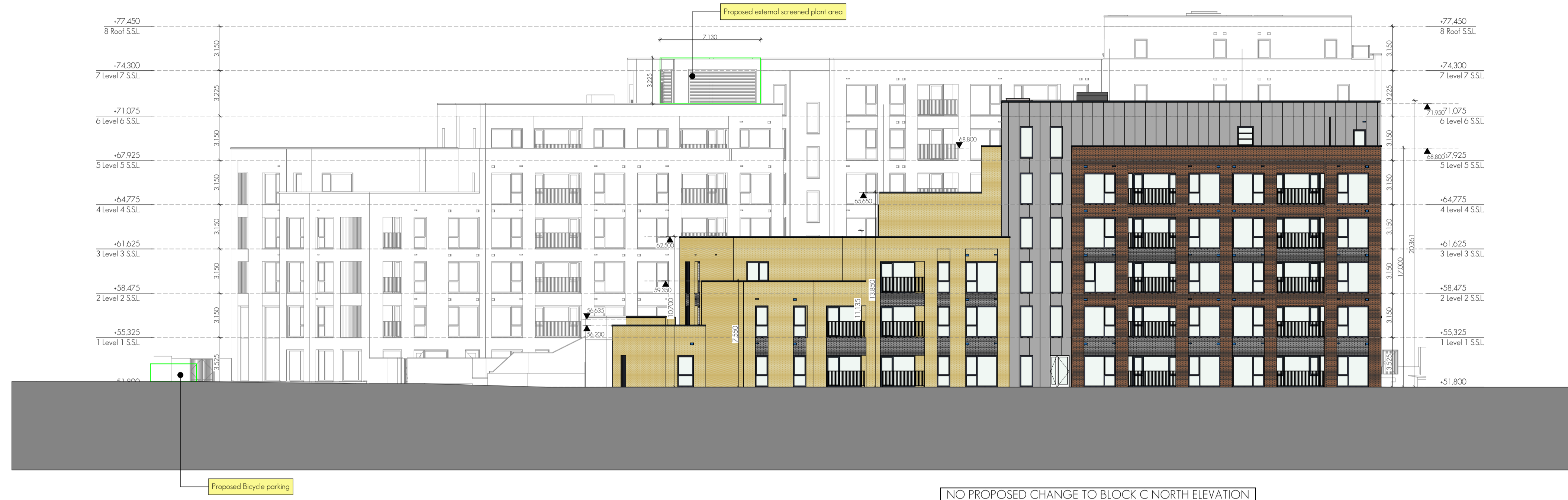
North Elevation 1:200